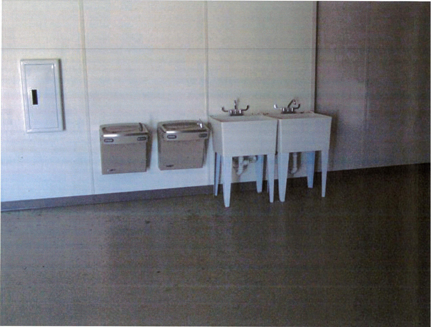
Attachment: building relocation (1259 : Building moving expenses)