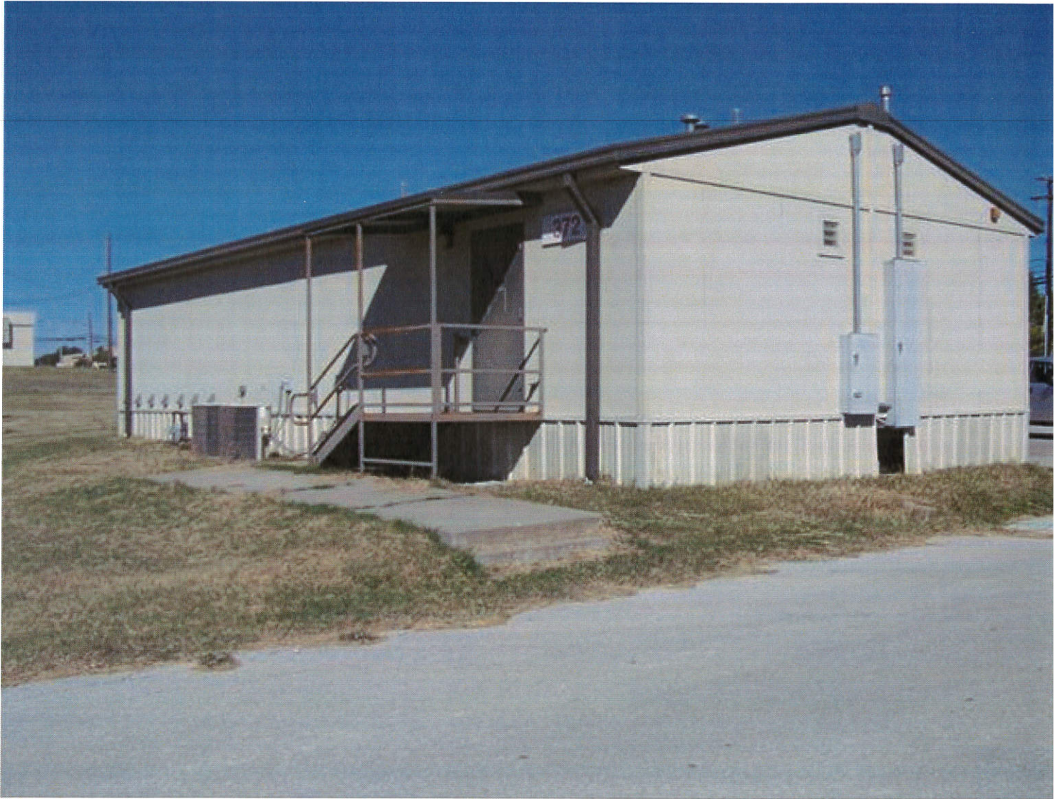
Attachment: building relocation (1259 : Building moving expenses)