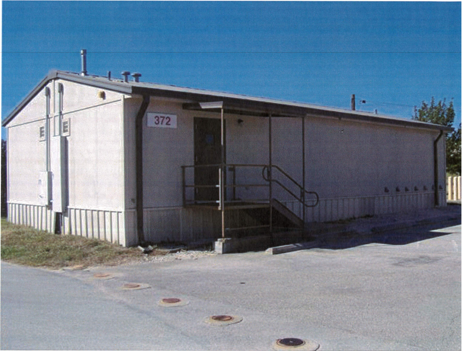
Attachment: building relocation (1259 : Building moving expenses)