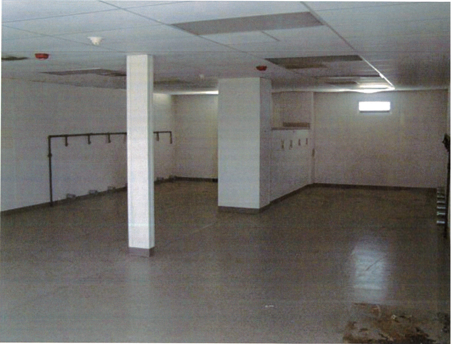
Attachment: building relocation (1259 : Building moving expenses)